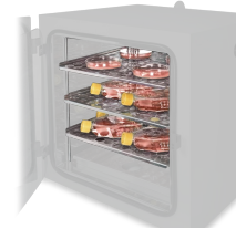
RS6 BS-010425-GK rack with 3 shelves Rack with 3 shelves