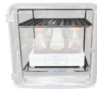
RS2 BS-010425-HK rack for CPS-20 / CTR-6 installation Rack for CPS-20 / CTR-6 installation