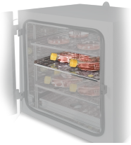
Additional shelf BS-010425-AK